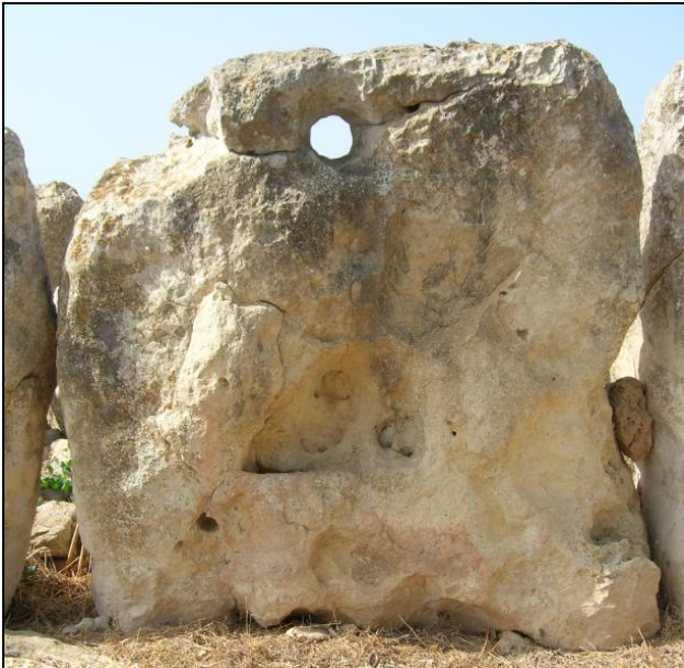
Figure 2. The fourth orthostat of the outer wall of the Main Enclosure.