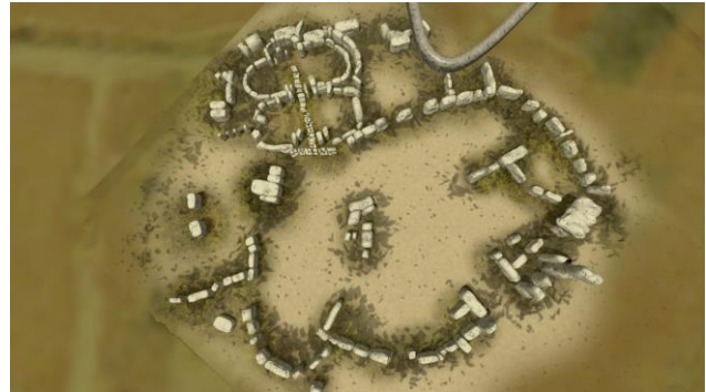
Figure 3. Virtual interactive model of the Borg in-Nadur temple (Stanco and Tanasi, 2013).