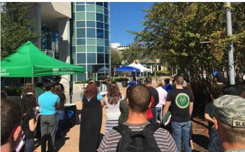
A moment of silence at USFSP