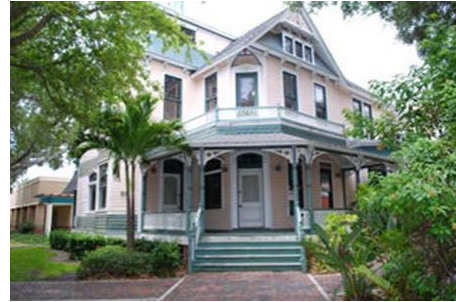
USFSP's Williams House

Join us on Saturday, Nov. 15, for the unveiling and dedication of a bronze marker at USFSP's historic John C. and Sarah Williams House. The marker is a donation from the St. Petersburg Chapter, Colonial Dames XVII Century, as part of its 60th Anniversary celebration. One of the objectives of the Society is to aid in the preservation of U.S. historic sites.