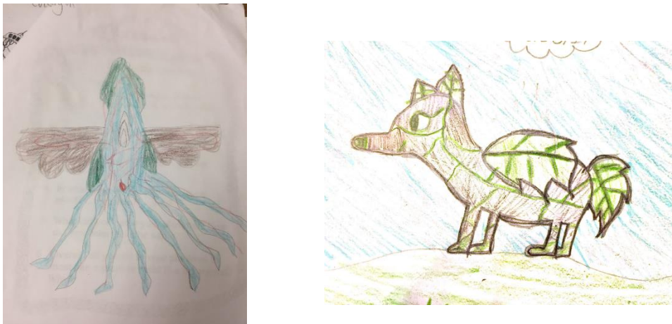
Figure 5. Examples of completed planimals.

differences between plants and animals. Some examples of completed planimals can be found below.