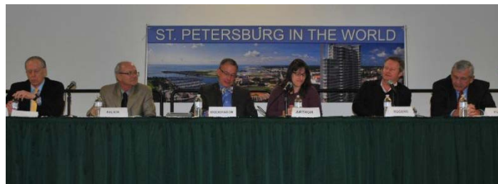
A panel discussion at this year's conference.

Make plans now to attend the Second Annual St. Petersburg Conference on World Affairs at the University Student Center February 13-15. Participate in three days of listening and learning as 14 panels of diplomats, military, media, and academic experts discuss the critical international issues of the day. The conference, which is a cooperative venture of a group of civic-minded St. Petersburg residents and the USFSP Honors Program , is free and open to the public. Several hundred people attended the inaugural conference this year. Sign up today.