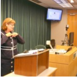
Getting ready to teach online