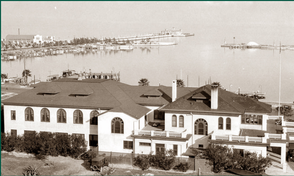
After opening in 1926, the “Million Dollar Pier” became a popular gathering place along the Tampa Bay waterfront. The St. Petersburg Yacht Club appears in the foreground.