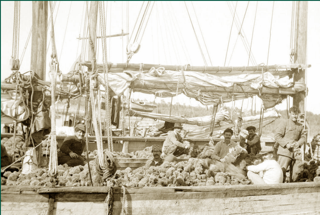
Spongers with their bountiful catch anchor at the sponge docks in Tarpon Springs.