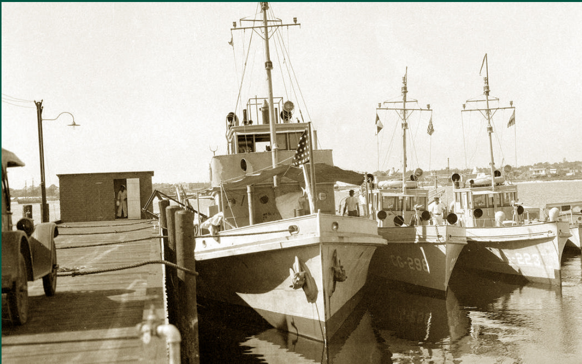
The Coast Guard Station protected the entry to Bayboro Harbor by the late 1920s.