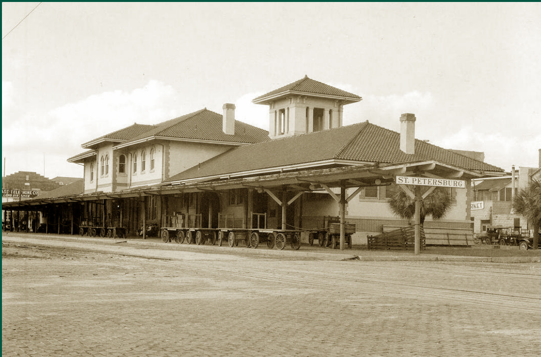
The train depot along First Avenue South near Third Street welcomed visitors in the 1920s.