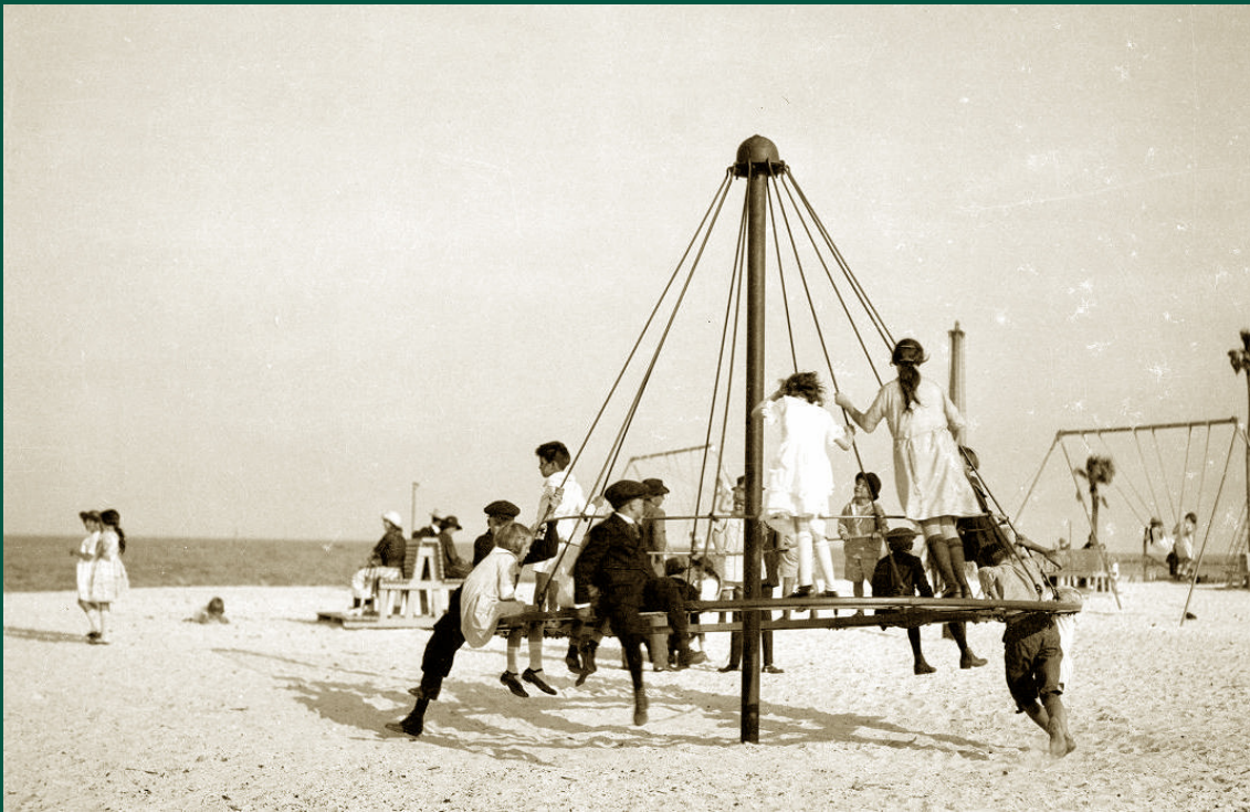
Children playing at Spa Beach, near the Municipal Pier, in the mid-1920s.