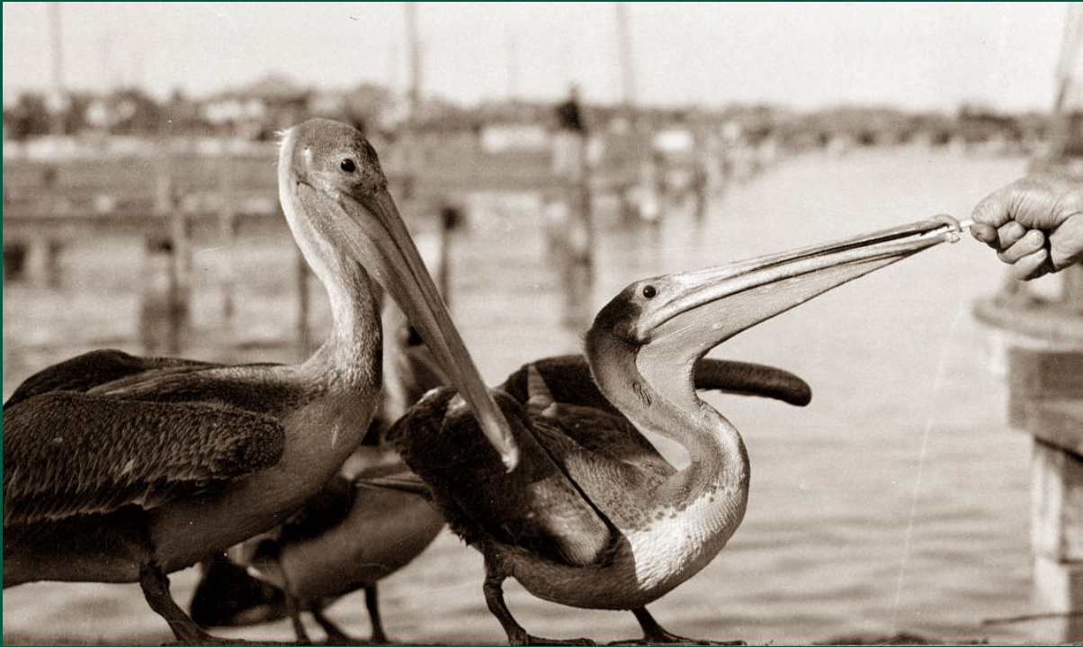
Feeding pelicans along Tampa Bay was a popular activity during the late 1920s.