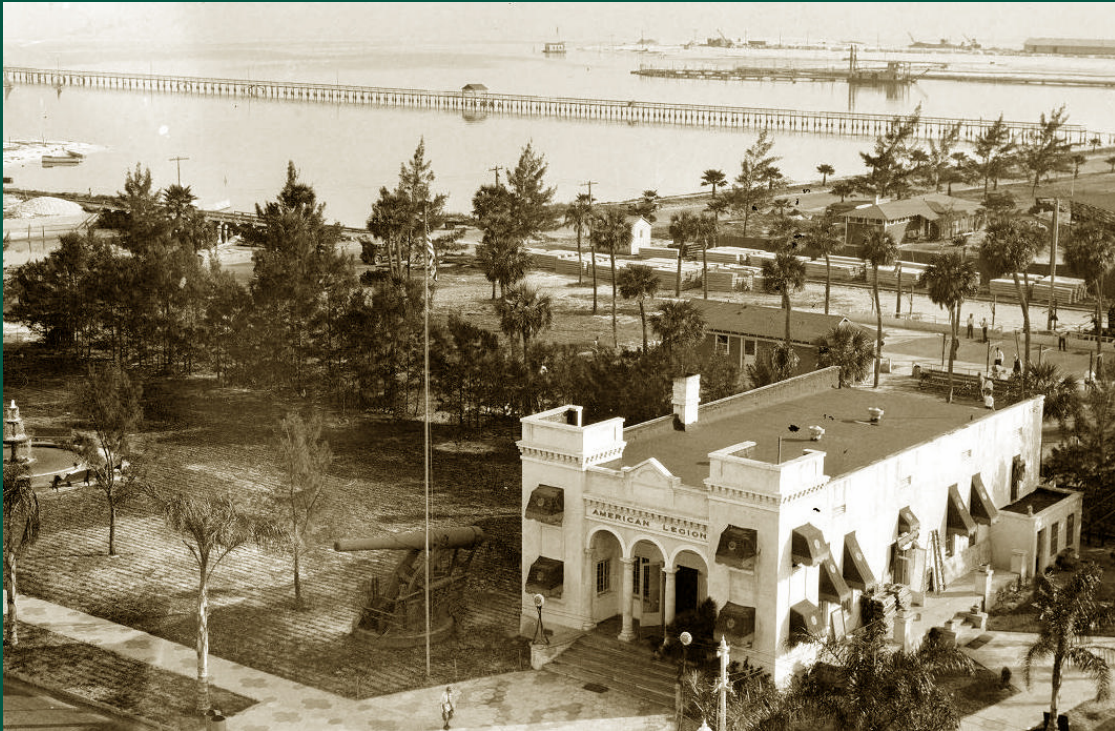
The American Legion Hall and original railroad pier in downtown St. Petersburg, circa 1927.