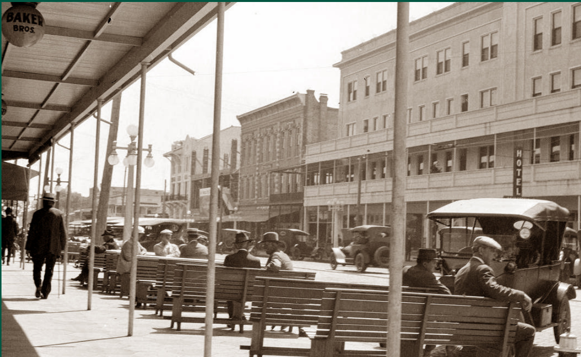
Residents and tourists congregated on the famous downtown “green benches,” circa 1927.