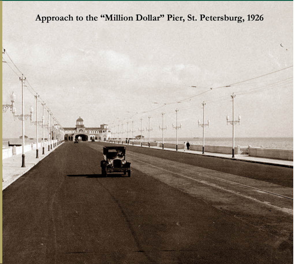
Approach to the "Million Dollar" Pier, St. Petersburg, 1926