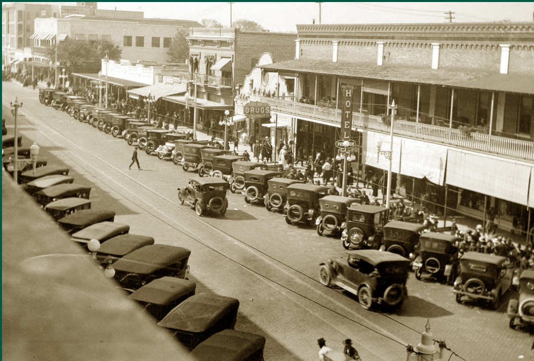
The Sunshine City prepares for another busy winter season on Central Avenue, circa 1927.