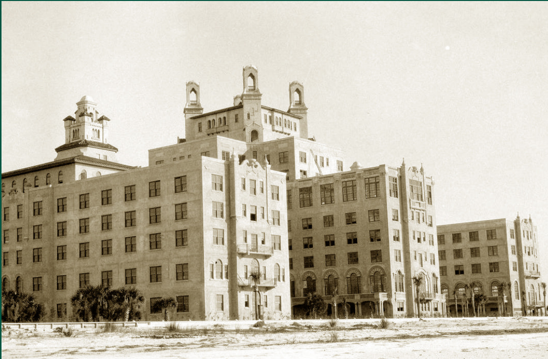
The Don CeSar Hotel on Pass-a-Grille dominated the skyline when it opened in 1928.