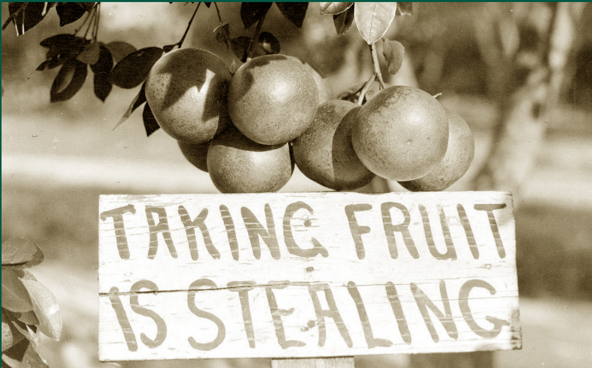
A not-so-gentle warning as Florida suffered during the Great Depression in the 1930s.