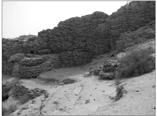
Fig. 9: Shell-like basin reminding of the large sea-shell in Boticelli's "Venus" (left, with one of the authors standing in it) and cup-like tufa (Sinkhole 5, southern wall). Note the terraces left by the sinking water level in the foreground.