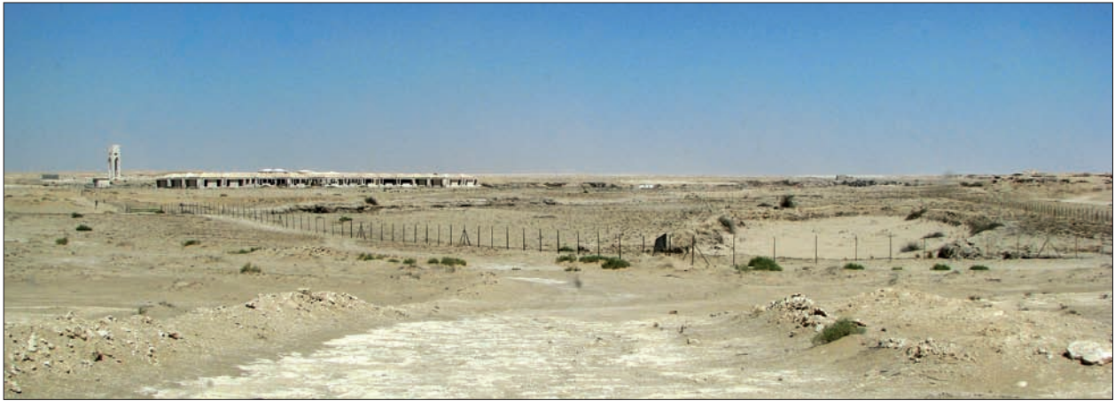
Fig. 2: The Layla Lake Hotel overlooking the dried-up lakes in the southern section of the area.

las of Saudi Arabia lists 17 lakes (Ministry of Agriculture and Water, 1984). It also lists the electrical conductivities of the lake water that ranged from 2510 to 8600 \mu\text{S}/\text{cm} , i.e. the values are higher than expected for carbonate saturated waters. Some of the values appear to have been even higher than for gypsum (or anhydrite) saturated waters, but this may be due to ongoing evaporative concentra-