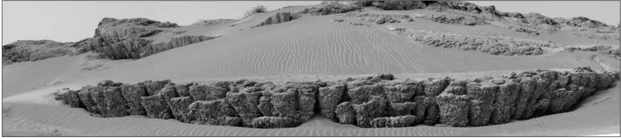
Fig. 10: Panorama of a step-like assemblage of gour-like tufa forms in the northern part of Sinkhole 4. Since the lakes dried up, sand started to drift in. Note the ripple marks on the dune slopes accentuated by white gypsum dust (length of view ca. 50 m).

change from bottom to top (example Sinkhole 2, eastern wall; Fig. 7): At the bottom the crust forms a solid, overhanging panel with only shallow vertical grooves. Above, the crust is more segmented into m-sized bulbous, inverted cones and further up (left on Fig. 7) the tufa forms protruding, upward-oriented, shovel-like bowls or cups (Fig. 8). Some of the cups are more delicate than in other places and can form large shell-like basins (Fig. 9). The rims are often less than 10 cm thick and the cups are par-