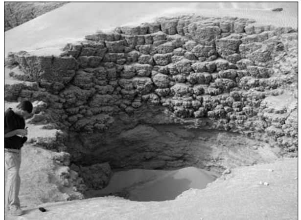
Fig. 11: Tufa gours at the northern wall of Sinkhole 4b suggesting origin of tufa by water cascading down from the up-slope side of the sinkhole.