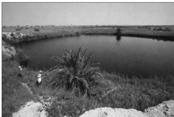
Fig. 1: Two of the smaller Layla Lakes still filled with water in the beginning of the 1980ies (Ministry of Agriculture and Water, 1984).

The largest series of sinkholes is, however, found south-east of the town of Layla, 300 km south of Riyadh. Most of them were filled by lakes until the mid 1980's (Fig. 1). A hotel with bungalows and restaurant was built overlooking the largest lake in the south (Fig. 2). But it apparently never went into operation because here the same happened as in Ain Heeth: water was abstracted not only