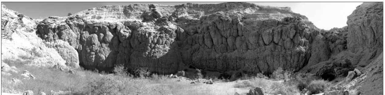
Fig. 7: Panorama view of the eastern wall of Sinkhole 2, showing clear vertical change in the morphology of the tufa.