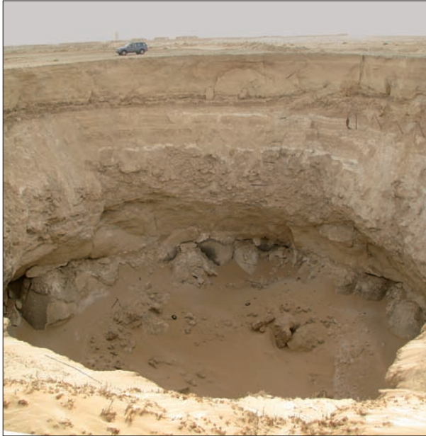
Fig. 3: Sinkhole No. 6, note tufa at bottom of lake and layered lake chalk profile near the top (car for scale).

naea arabica; a very common fresh water snail) while the second one, (the cerithiid Melanoides cf. tuberculata , O. F. Müller, 1774; Krupp & Schneider, 1988; Neubert, 1998; pers. com. H.-J. Niederhöfer, Stuttgart; the species is salt tolerant and lives in warm waters), was found only in one place (half-way down in Sinkhole 2). The shallow lake bottoms (around the sinkholes) was occupied by reeds, the roots of which are still noticed everywhere.