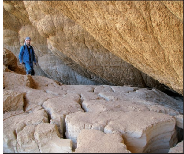
Fig. 5: Shrinkage of lake-bottom chalk deposits has caused their subsidence by over one meter. The former contact of the sediment with the solid tufa is marked by a small ledge (Sinkhole 2, eastern side).

The bottom of those sinkholes that contained lakes as well as the flats around the sinkholes is composed of