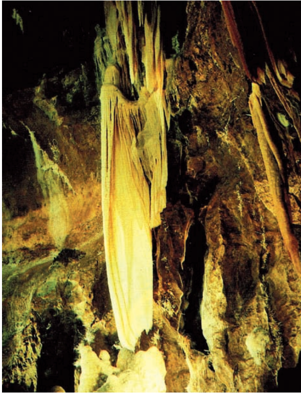
Fig. 2: Temple of Baal, Jenolan Caves, New South Wales

for permanency, and although there is no question that it can be reversed and so restoration may be possible, it is all too rarely attempted. The widespread karst deserts of China are well known, but current research is furthering our understanding of the processes at work, including the formerly neglected role of microbiota.