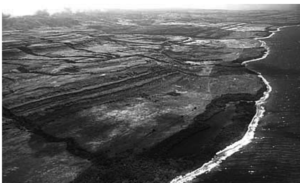
Fig. 10: The terraces on the Northern side of the Huon Peninsula, Papua New Guinea are a wondrous source of geo-climatic history