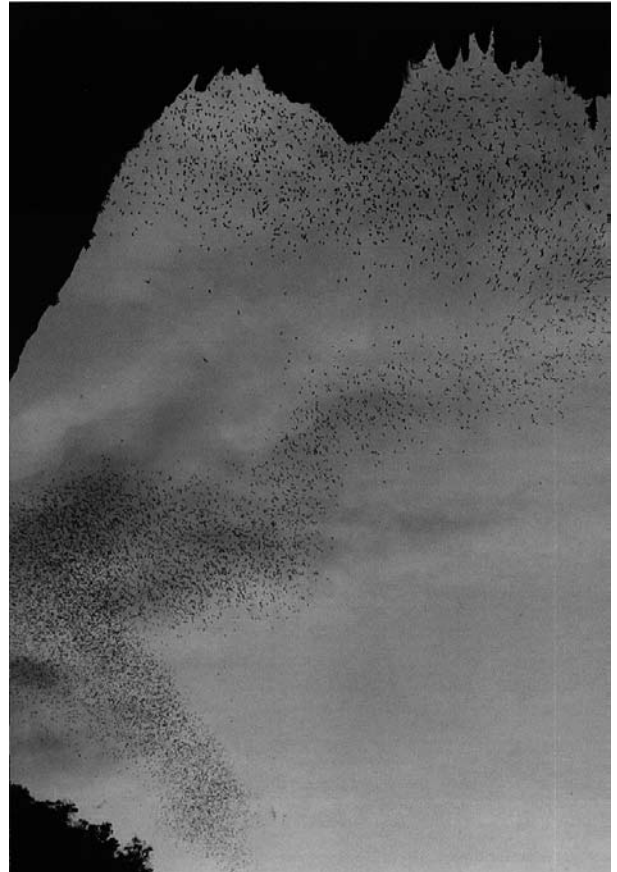
Fig. 9: The bat flight from Deer Cave, Gunung Mulu WHA, Malaysia

only upheld the appeal, but also wrote the precautionary principle into his judgment.