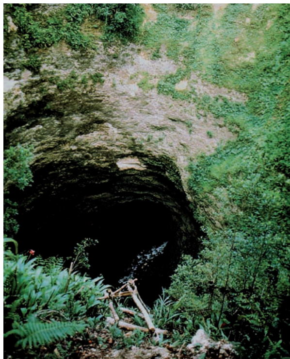
Fig. 6: Another majestic sight: Nare Doline (over 300 m. deep) on the Nakanai Plateau, Papua New Guinea