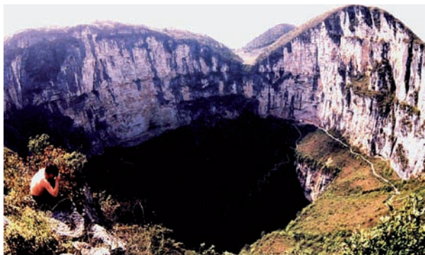
Fig. 5: One of the examples of sublime majesty: the Xiaozhai Tiankeng of China

So, in summary, we must strive for total catchment management and on-going monitoring of recharge or of drawdown. The importance of deliberative environmental restoration is at last being recognised, even though Marsh argued back in 1864 that forests destroyed by human action need human action to ensure their recovery.