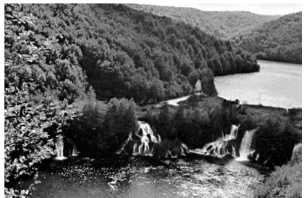
Fig. 16: The beauty of the Plitvice Lakes WHA, Croatia