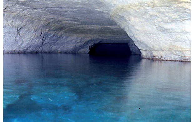
Fig. 3: Groundwater is of great value, but often adds to the beauty of caves: Weebubbie Cave, Nullarbor Plain, Western Australia

Regrettably, even conservation activists may well lack proper understanding of the character and behavior of groundwater. One striking example from this region