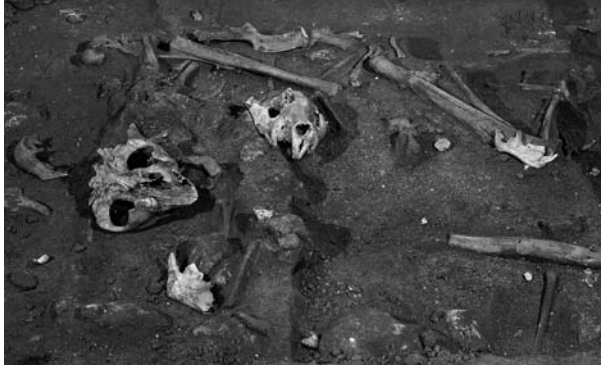
Fig. 7: One page from the Library of the History of the Earth: Victoria Fossil Cave, Naracoorte Caves WHA, Australia

I am glad to say that after two days in the witness box in the course of challenging an application for mining on a particularly important karst area, the judge not