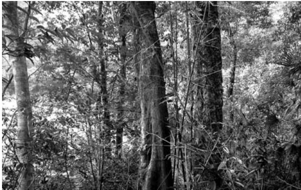
Fig. 12: The wonderful Maolan forest of China, managed on a basis of sustainability by the Shui people

Sedimentation can result from any form of soil erosion or mobilization. In New Zealand, the Waitomo Glowworm cave was threatened when a farmer cleared a hillside some 25 miles upstream of the cave. The result-