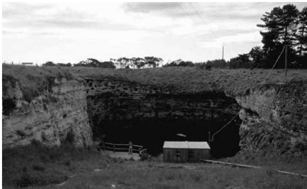
Fig. 8: Gouldens Hole - One of the Cenotes in the Limestone Coast region, South Australia: both a beautiful place and a point of access to an immense groundwater reservoir through both the nineteenth century excavated ramp and the modern pumping station