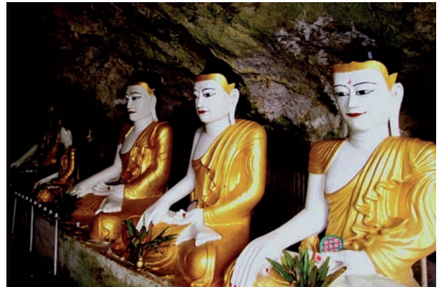
Fig. 4: Khayon Cave, near Mawlamyine, Myanmar (once known as Farm Cave and an important biological site) is a fine example of the religious use of caves

occurred when Croatia first proposed a change of boundary of the Plitvice Lakes World Heritage area in order to encompass (and hence control) the upper section of the catchment area. Many of the referees who were consulted totally failed to recognise the importance of this and argued that the World Heritage Committee should reject the proposal because “it did not add to the biodiversity of