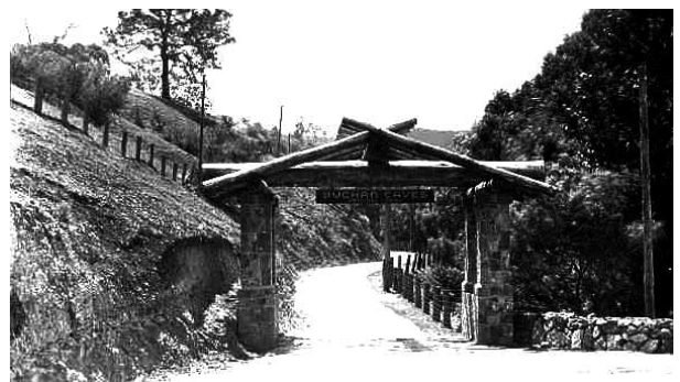
Fig. 11: Buchan Caves, Victoria, preserved as a National Park, now Caves Reserve. (1938 photograph made available by Park Manager D. Calnin)

There is also the potential for adoption of minimal impact codes of practice. Speleologists have used such codes in various forms, e.g., the Honour Code of the Swiss Speleological Society and the Minimum Impact Code of the Australian Speleological Federation. At the other extreme of scale there is an excellent example in the Cement Sustainability Initiative (WBCSD 2002).