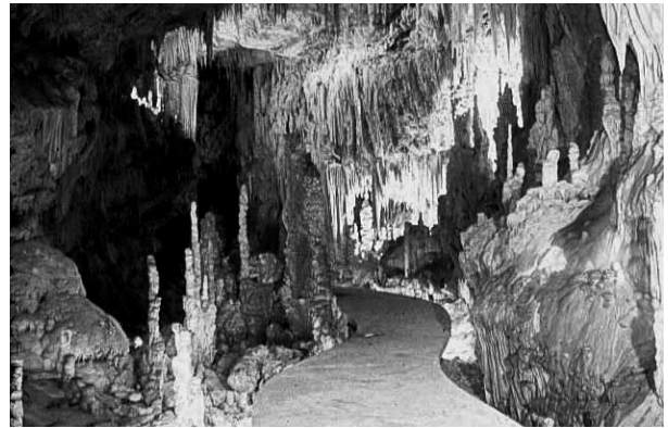
Fig. 14: The main pathway through Jeita Cave, suspended well above the floor on pillars, and with all electric fittings concealed under the pathway

ing muddy run-off entered the river and progressively settled, killing the Chironomid and other larvae which were growing all along the river and which normally provide the food source of the glowworms. In Vietnam, a clumsy road construction mobilized immense amounts of mud into several underground rivers and from there to the major surface streams draining the karst.