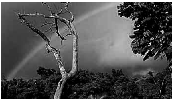
Fig. 13: The Havalu Forest of Niue managed as a "National Park" since the original inhabitants first arrived over 1,000 years ago.

ing muddy run-off entered the river and progressively settled, killing the Chironomid and other larvae which were growing all along the river and which normally provide the food source of the glowworms. In Vietnam, a clumsy road construction mobilized immense amounts of mud into several underground rivers and from there to the major surface streams draining the karst.