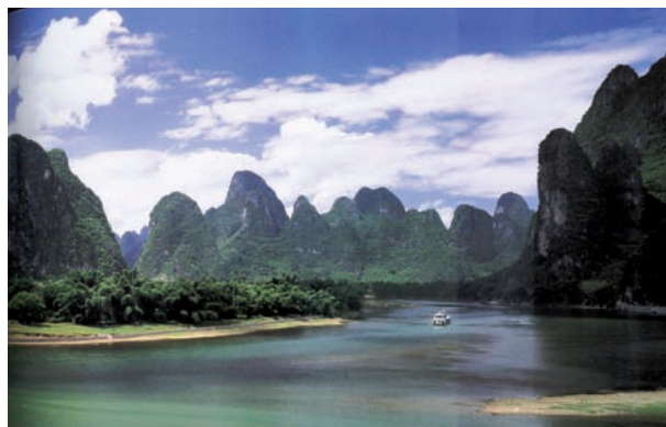
Fig. 1: The famous towerkarst of Guilin in China is famed for its beauty

Many karst systems are places of striking, even sublime beauty (Burke 1756). In turn this is coupled, for many people, with a genuine sense of spirituality. Most such landscapes thus have extremely important cultural values that may even have persisted continually since the Neolithic.