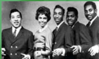
Smokey Robinson and the Miracles

The “Queen of Soul” Aretha Franklin presents a collection of rare performances by legendary R&B artists of the classic 1960’s and 1970’s soul era, including long-lost archival material that has been recovered from film vaults across the United States, England, Germany and France.