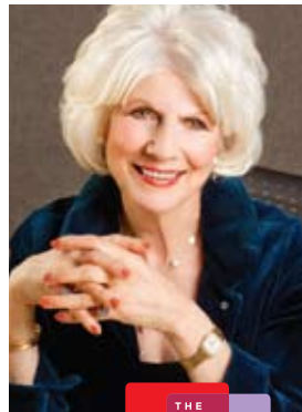
THE DIANE REHM SHOW One of her guests is always you.

A heartfelt thanks to the 4,290 people who participated in WUSF's radio and TV spring membership campaigns. A total of $550,000 was raised in support of great programming. A hearty welcome to our 1,580 new members and bravo to all of our volunteers, staff and renewing members who made this another terrific success!