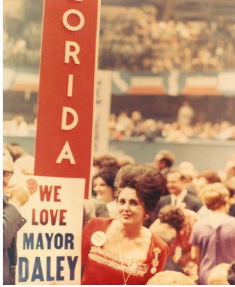
Democratic National Convention Chicago, 1968