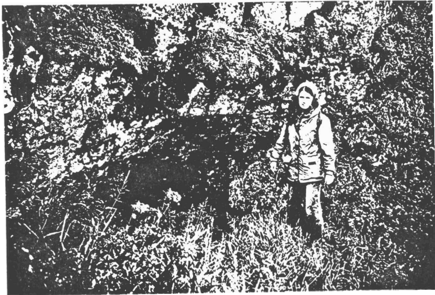
Lava Tube Cave on Bogoslof Hill, St. Paul, Alaska