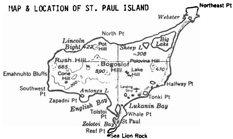
St. Paul Island