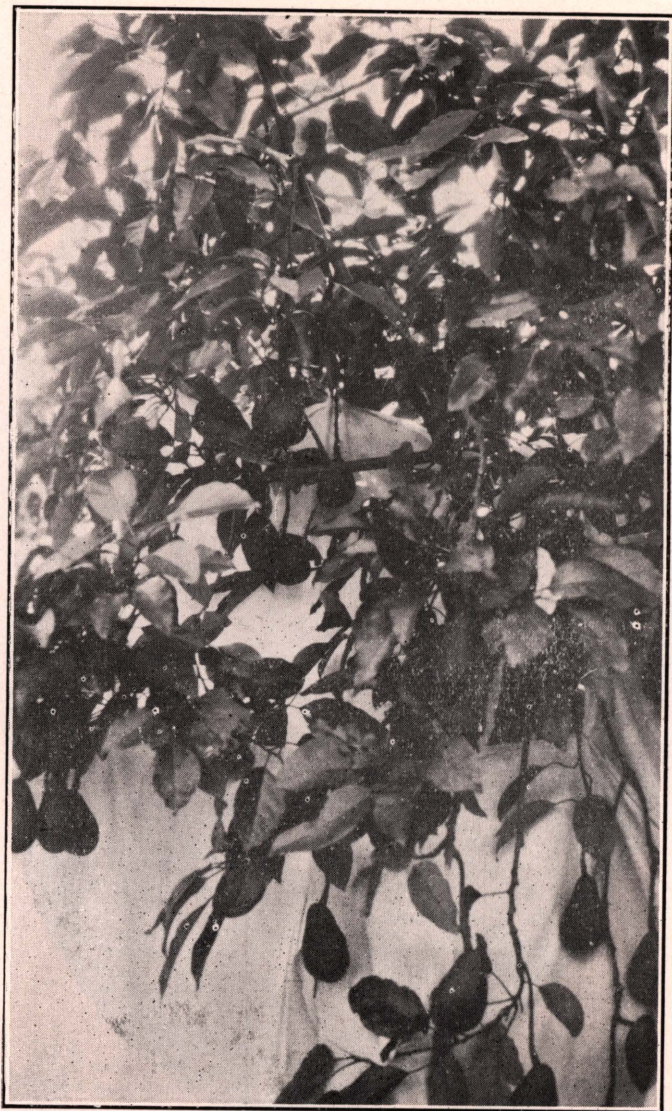
Fuerte Avocados on Tree 2\frac{1}{2} Years Old at Our Nursery

FUERTE —A Mexican-Guatemalan hybrid which is noted for its hardiness and the richness of its fruit. It is a very vigorous grower, of broad spreading form, and an early and heavy producer. The fruit is pyriform in shape, skin thin and hard, color green, weight about a pound to a pound and a half, seed small and tight in cavity, flesh cream yellow, well flavored and nutty, having the highest fat content of any of the commercial Avocados. Ripening season October to February.