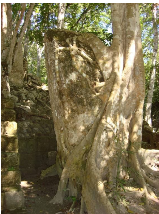
Figure 1. Example of natural destruction of carved stone stela at the site of Calakmul, Campeche, Mexico

pollution, and root intrusion can imperil the archaeological record. Natural hazards including hurricanes, floods, earthquakes, and landslides have impacted ancient and modern Mesoamerica 20-24 . Recently, exuberant plant and vine growth that has relentlessly enveloped archaeological sites and monuments in tropical environments has increased substantially 25, 26 (Figure 1). Videla 27:335 demonstrates that many Mesoamerican monuments are “suffering deterioration caused by environmental factors...and by the action of micro- and macro-biological communities.” These latter factors are subsumed under the term biodeterioration, which is defined as any undesirable or detrimental alteration in the properties of a material caused by the vital activities of organisms 28, 29 .