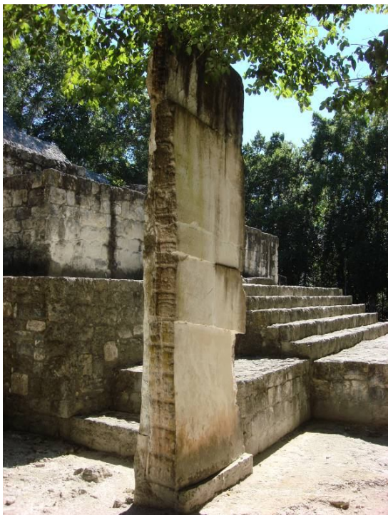
Figure 2. Example of human destruction of carved stone stela at the site of Calakmul, Campeche, Mexico, where looters cut carvings from monument.

Mesoamerica is having a deleterious effect on the archaeological record 33 .