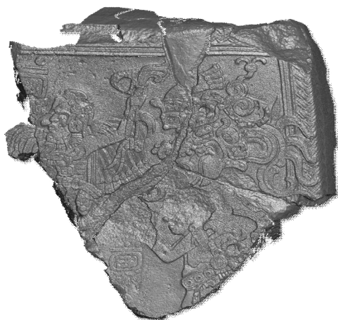
Figure 3. Scan image of Kaminaljuyu, Guatemala Stela 10

Archaeological research and analysis are substantially enhanced and facilitated by the use of scan data sets, and in-depth, comprehensive examinations of the stone and its sculpture can be conducted in a virtual computer environment. Our work has demonstrated that the 3-D data acquired through scanning allows objects to be analyzed, visualized, measured, and evaluated more effectively and precisely than if the researcher were in the field or had the physical object in their presence (Figure 3). The objects can be virtually rotated 360° and viewed in true three-dimensions. The angle of the light source can be maneuvered across the laser images to better observe and accentuate any portion of the object, sub-millimeter measurements can be made of any segment of the piece directly on the computer screen, and numerous visualization techniques can be used to enhance and clarify details. Also, we have developed methods of cross-sectional and profile analysis and Surface Elevation Modeling techniques expressly for investigation of carved stone monuments 40 (Figure 4).