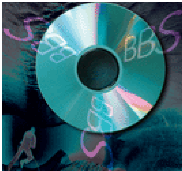
Le CD 17 ans (1988-2004) il coûte 220 CHF, 145 euros