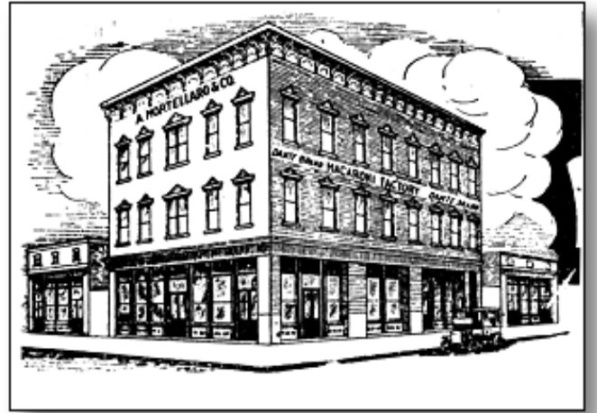
The Mortellaro Macaroni factory started on Seventh Avenue, near nineteenth street in a very small way. In time, business prospered, and the factory was moved to this three story building located on the southeast corner of Eleventh Avenue and Twentieth Street.