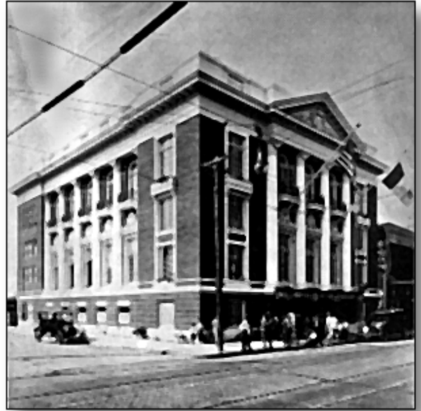
LaUnione Italiana – The Italian Club. This magnificent neoclassical building has been the center for social, cultural, and educational functions. Throughout the years, the palatial headquarters has been a symbol of pride to Tampa Italians, and a memorial to the glorious past of Italian civilization. Photo made in 1919.

During the month of March, 1886, a momentous event occurred in Tampa that