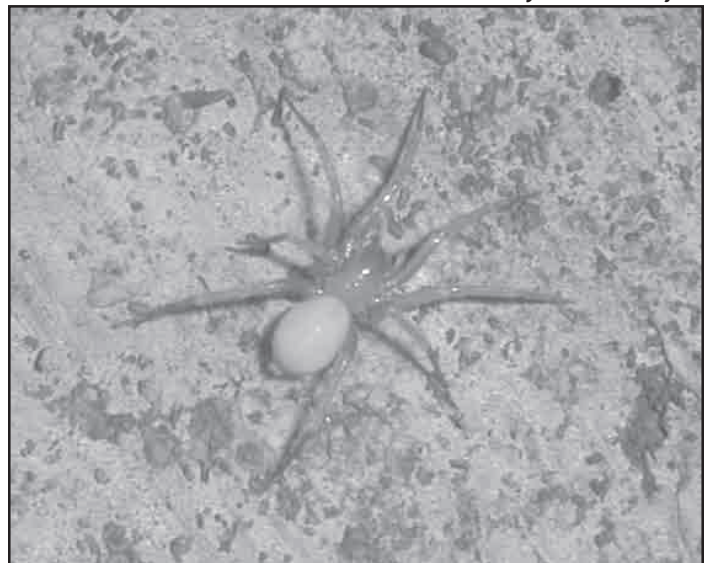
Endangered: This is an endangered meshweaver of the genus Cicurina that is named for Robber Baron's Cave.