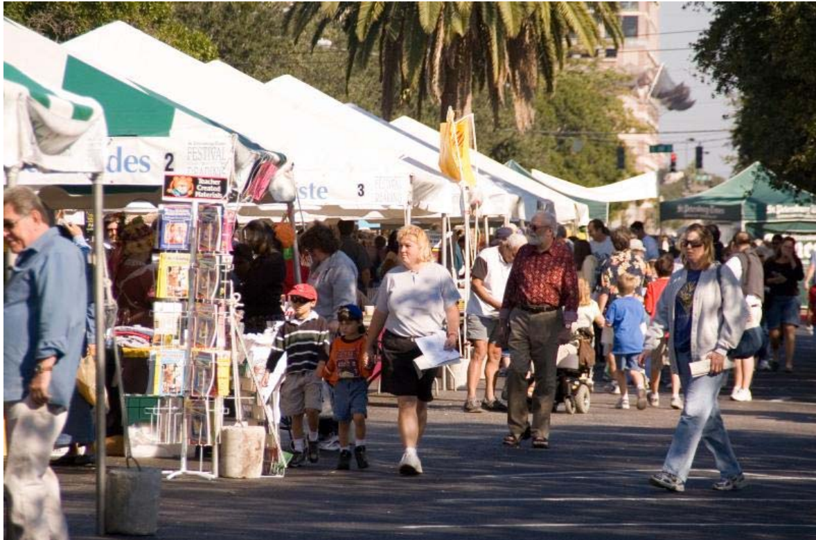
The Tampa Bay Times Festival of Reading features author talks and book signings.

Don't miss the Times Festival of Reading on Saturday!