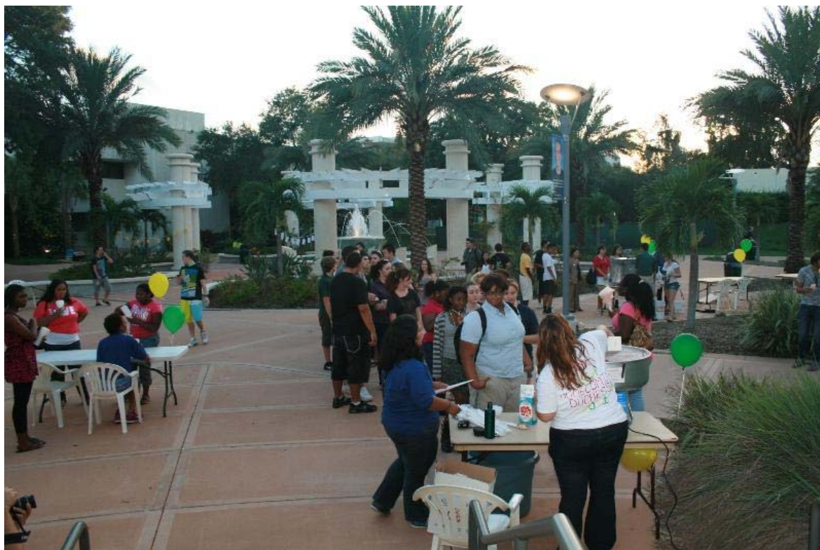
Lining up for Homecoming cotton candy at the Sembler Family Fountain at Harborwalk.

Homecoming is Oct. 22-27 and USFSP alumni are invited to join in the fun during a free carnival along Harborwalk from noon to 4 p.m. Wednesday, Oct. 24. The carnival will include cotton candy, kettle corn, sno cones, funnel cakes, and games, including corn hole and a mechanical bull. Mighty Mongo performs in front of the University Student Center throughout the day. Cardboard Boat Races, a Homecoming tradition, are Friday, Oct. 26, at noon along the USFSP Waterfront.