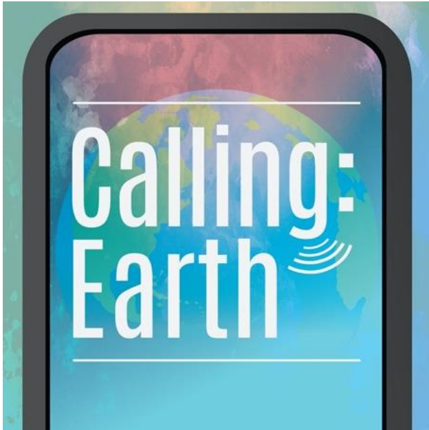
Figure 1. Season 1 Logo

The first logo continued to be used for the entire first season, but before the second season was released, the library's new communications and marketing coordinator assisted with the creation of a new logo that looked more sophisticated and more in-line with other podcast logos. Having an in-house graphics designer was extremely helpful in rolling out a new logo (See figures 1 and 2).