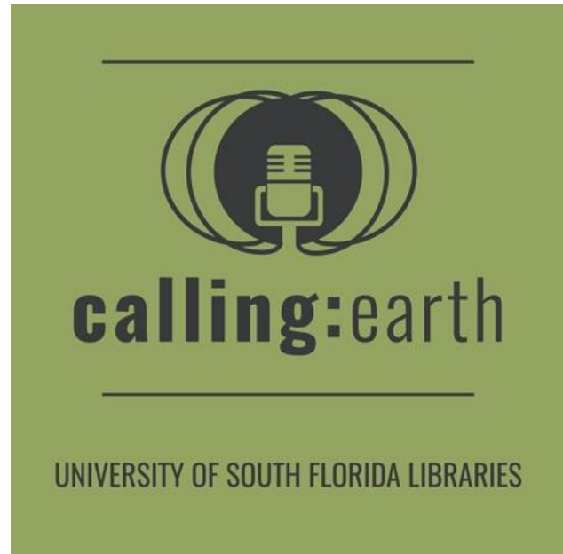
Figure 2. Current Logo