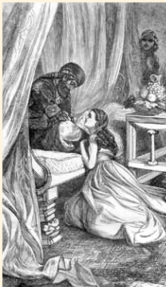
The Sultan Pardons Scheherazade engraving by Arthur Boyd Houghton