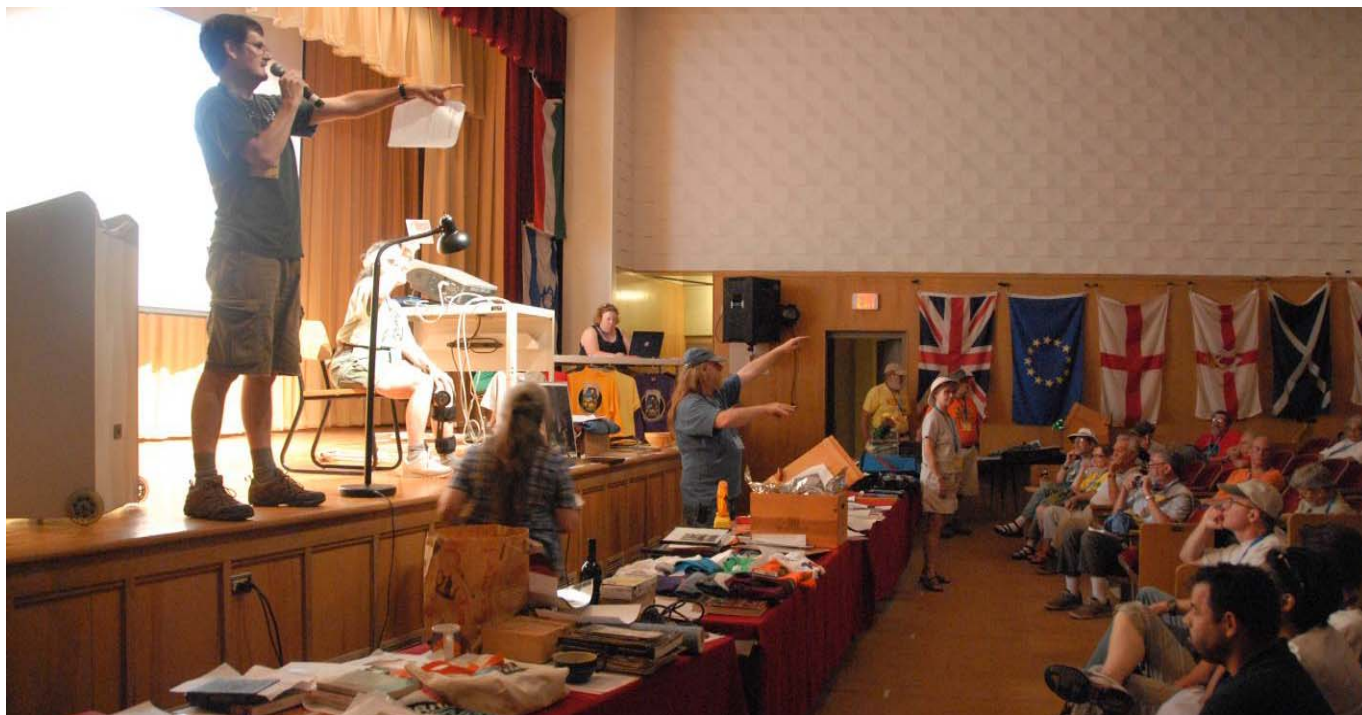
The first ICS Auction raised money for the UIS and the host organization, the U.S. National Speleological Society, from donated speleological books, art, supplies, and historical items.