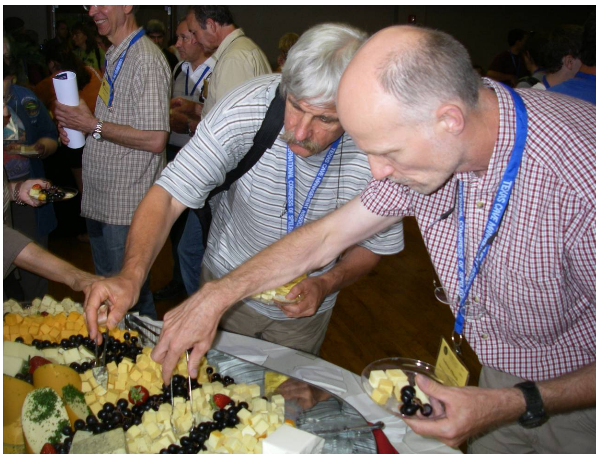
Speleologists from around the world enjoying the opening reception of the 15 th ICS.

If the new UIS Bureau is doing nothing with the height of annual fees for member countries, the UIS can face problem of lack of money if the donation program is stable, contributing the IJS, the BBS, and with operational costs we have. The review of available money for UIS since 1995 illustrates this well.