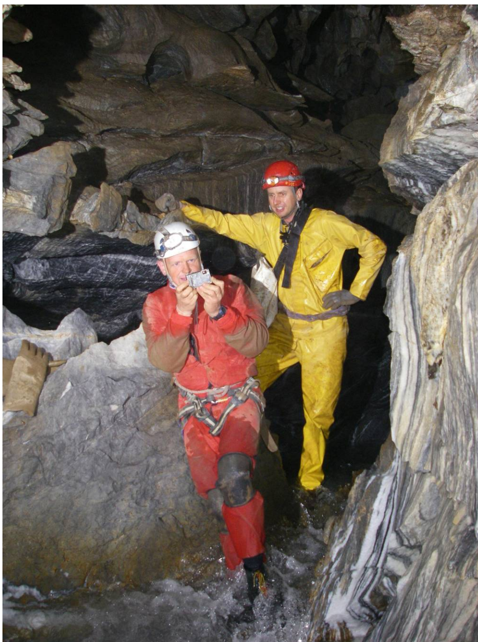
15 th ICS pre-Congress field trip to Lilburn Cave, California, USA.

Excavations should remove only a fraction of the deposit of interest to ensure that a major portion is left untouched for future work.