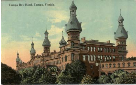
The Tampa Bay Hotel hosted TR Roosevelt & Army Headquarters

would marry upon his return, a decision she immediately and forever regretted.