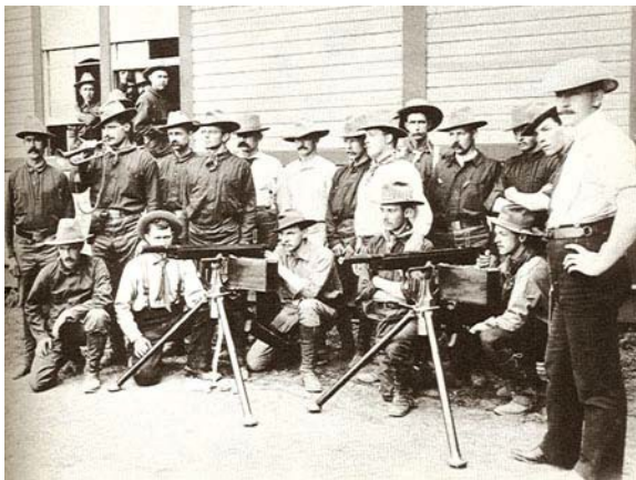
Rough Riders Training with Colt Machine Guns, Donated by Tiffany's

It took seven locomotives and seven sizeable train sections to transport over 1200 horses and mules as well as to carry 999 Rough Riders to Tampa. The first stop was in New Orleans, Louisiana, where the men were given supervised permission to