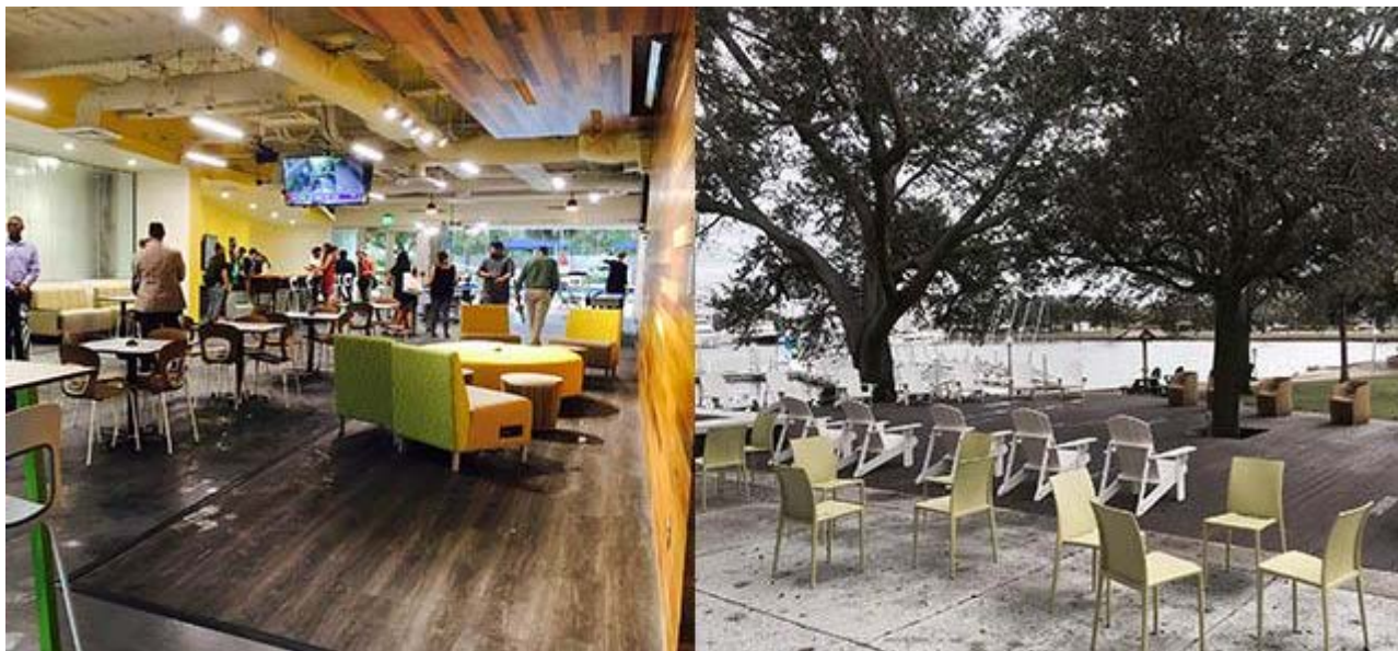
The inside and outside of The Edge will be a primary destination for student activities throughout the year.

USFSP's newest waterfront destination for academic and leisure pursuits is now open. Adjacent to the pool and within Coquina Hall, The Edge - named for its location on the edge of campus - seeks to be the main destination for bringing students together throughout the year.