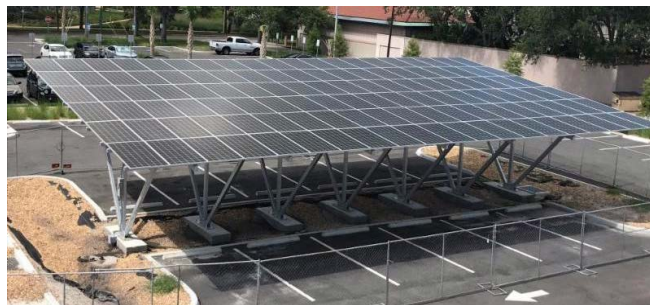
This 40kw solar array carport on campus will power 15 percent of the new Poynter Warehouse Labs.

Spearheaded by an active student body and faculty, the USFSP community is investing in solar panels and energy efficient buildings, leading innovative research in sustainability and incorporating environmental stewardship into many planning decisions on campus. These were just a few of the reasons why the university received a Silver rating for sustainability performance by the Association for the Advancement for Sustainability in Higher Education (AASHE). This was the first time USFSP received such an honor.