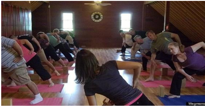
Exhibit 7. Wegman's staffs are doing Yoga class