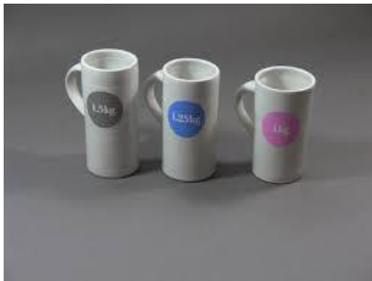
Exhibit 2. Coffee mugs

Part-time employees at Apple enjoy the same health benefits as full-time employees (Eadicicco, 2015). Managers developed a Design Plus Health kit for their employees. The kit contains weighted coffee mugs (see Exhibit 2), which work as dumbbells when the employees drink coffee or water. The kit also contains coasters (see Exhibit 3) with images of teeth so that employees can see the stains they might leave on their own teeth if they drink too much coffee or tea. There are healthy sticky notes in the kit to remind employees to eat healthily or exercise more (See Exhibit 4). Since most people live a busy and fast lifestyle now, they have little time to go to the gym. Apple gave Design +Health guidebooks to its program designers to teach them how to do some exercise in the office (see Exhibit 5).