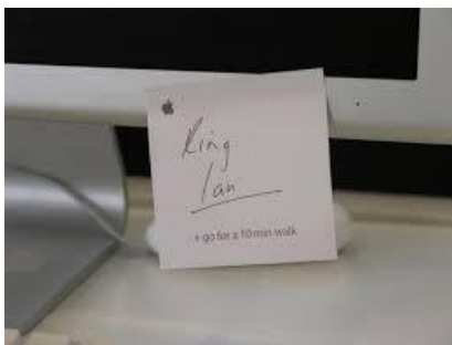
Exhibit 4. Healthy sticky notes