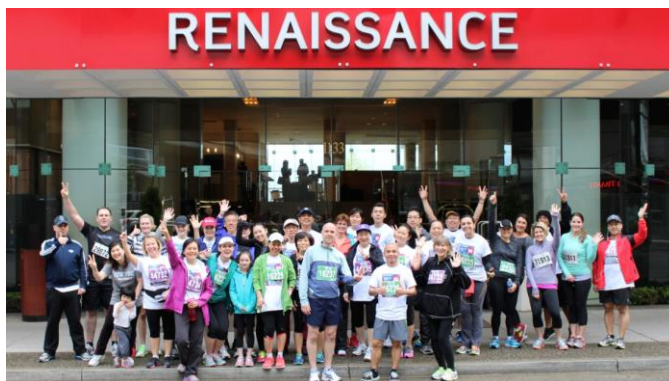
Exhibit 8. Over 100 Marriott hotels in the U.S., U.S.V.I. and Canada that achieved the TakeCare Healthy Hotel Certification for 2014.