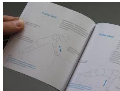
Exhibit 5. Design +Health guiding books