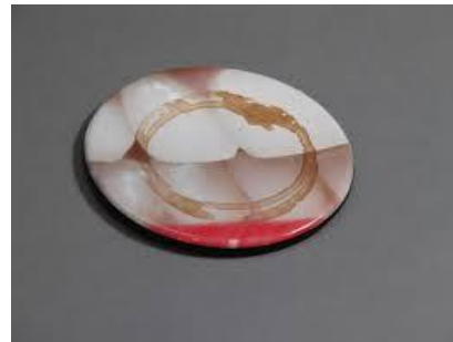
Exhibit 3. Coffee coasters