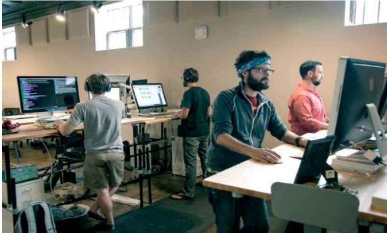
Exhibit 1. The Googlers are working on their standing desks.