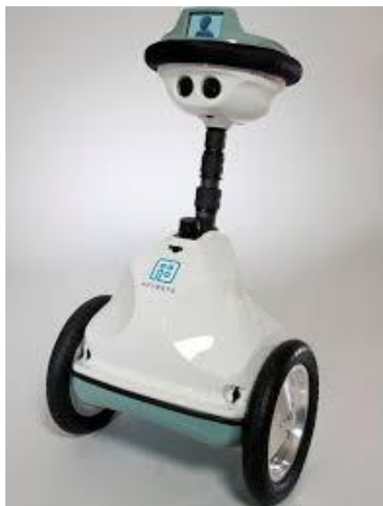
Exhibit 6. Anybots in Evernote office.