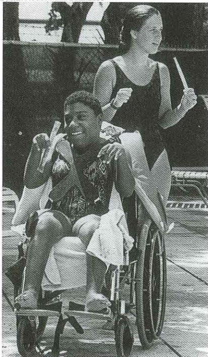
A happy camper in a wheelchair inspires can-do attitude at "Camp Can-Do" in Sarasota.