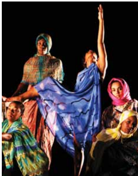
What the Heart Remembers: The Women and Children of Darfur