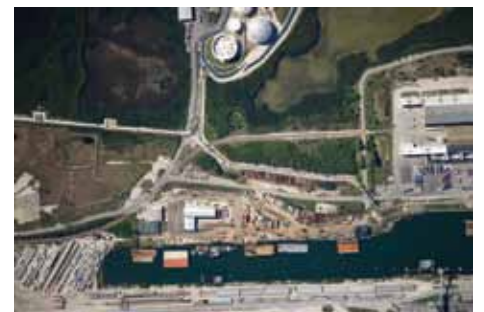
Aerial photo of Port Tampa