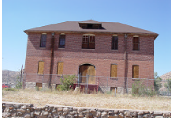
Indian Boarding School

Hualapai Indian Boarding School: The Hualapai Indian Tribe (Tribe) is working with AGFD, Bat Conservation International, and the Lower Colorado River RC&D to develop artificial roosts for Townsend's big-eared ( Corynorhinus townsendii ) and various myotis bat species that occupy a vacant Indian boarding school. The Tribe plans to restore the historical structure as a museum and the process will exclude about 500 bats from their current summer residence. The Tribe has agreed to install two belfry tubes for the myotis species and to erect a cinder block tower for the big-eared bats.