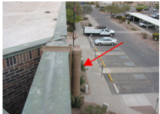
MCFDX Belfry Abode

Desert Botanical Garden (DBG) Experimental Bat Homes: DBG administrators have agreed to install four different belfry bat abodes in the garden. In April 2006, two experimental abodes will be installed on a north-facing wall of DBG's new Learning Center and the other abodes will be mounted on steel poles near the Australia Outback pond. AGFD will monitor the artificial roosts for bat use and log temperature regimes in the belfry abodes. The abodes will have varying configurations for comparison including wall-mount belfry with and without sand insulation, and pole-mount belfries with and without additional reflective roofing.