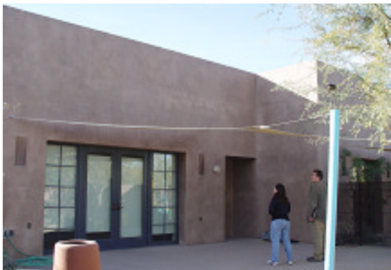
DBG Learning Center

Desert Botanical Garden (DBG) Experimental Bat Homes: DBG administrators have agreed to install four different belfry bat abodes in the garden. In April 2006, two experimental abodes will be installed on a north-facing wall of DBG's new Learning Center and the other abodes will be mounted on steel poles near the Australia Outback pond. AGFD will monitor the artificial roosts for bat use and log temperature regimes in the belfry abodes. The abodes will have varying configurations for comparison including wall-mount belfry with and without sand insulation, and pole-mount belfries with and without additional reflective roofing.