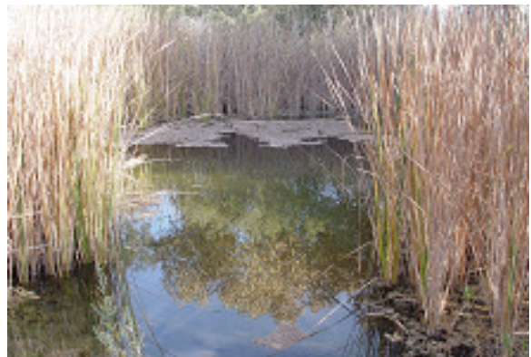
Australia Outback Pond