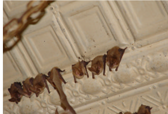
Townsend Bat Residents