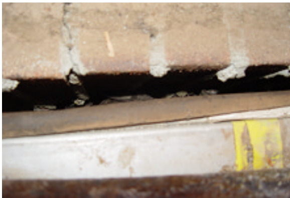
MCFDX Wall Occupants

Maricopa County Flood Control Building (MCFDX): Mexican free-tail bats ( Tadarida brasiliensis ) are regular winter visitors to the MCFDX building in Phoenix. Over 400 free tailed bats were allowed to use the crevices between brick layers in a parapet wall until they strayed into the office areas of the building. AGFD bat biologists and volunteers were called upon to assess the entry points, devise a method to exclude the intruders, and to install alternate artificial roosts. AGFD in collaboration with Maricopa County administration and roofing contractors, successfully installed two belfry tube bat abodes from the parapet, and then excluded the migrants from the wall on March 13, 2006.