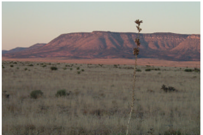
Looking Northeast across Aubrey Valley to the Aubrey Cliffs

Volunteers in Arizona. Experienced volunteers are needed for a large survey effort to assess bat diversity and use patterns in Arizona's Aubrey Valley (75 miles west of Flagstaff, in northern AZ). A wind generation facility has been proposed along the Aubrey Cliffs overlooking the valley. Arizona Game and Fish Department (AGFD) has written a letter to the Arizona State Land Department in opposition to this particular project, expressing deep concerns over likely wildlife impacts including direct threats to bats, which are thought to be highly diverse and abundant in the Aubrey Valley area. This effort would provide much needed data to fully and scientifically address this threat. To date, no large scale or extensive surveys have been conducted in this area. The objective is to monitor multiple netting and audio stations within the valley and surrounding woodlands and along the cliffs. Experienced folks are needed to assist and/or lead survey teams. The 2006 survey dates are June 26th-28th. Logistical information will be sent out as those dates approach. Please contact Steve Goodman (AGFD) at sgoodman@azgfd.gov or (928) 692-7700, Ext. 2332 if you are interested in helping. Thank you and hope to hear from you soon. We believe this will be a meaningful effort toward bat conservation.