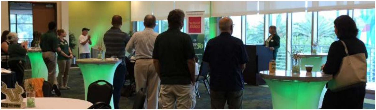
USF St. Petersburg alumni staff and faculty met for the inaugural USFSP Alumni Reception on Oct. 5. Light refreshments were served and the event was followed by the kick-off of Homecoming Week 2015.

October has been a busy month of celebration for USF St. Petersburg, with a number of events still to come: