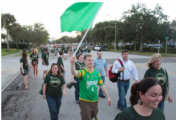
USFSP Night at the Rowdies 2014

Join USF St. Petersburg and members of the St. Petersburg community in supporting the Tampa Bay Rowdies as they take on the Carolina RailHawks at Al Lang Stadium on Saturday, Oct. 24, at 7:30 p.m. Admission is $10 with a USF ID, and tickets can be purchased online with the promo code USFSP15. This offer is limited to two tickets per ID presented at the box office.