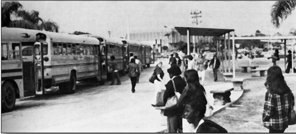
Black students were bused to Madeira Beach Middle School in the 1970s as part of the county's desegregation plan.