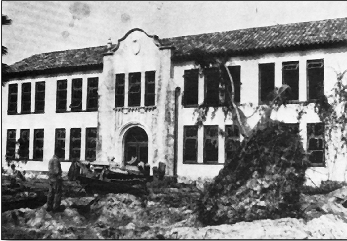
Rio Vista Elementary School on Macoma Drive Northeast in St. Petersburg was abandoned in 1935 due to low enrollment by white students. In 1950 it was remodeled and re-opened.